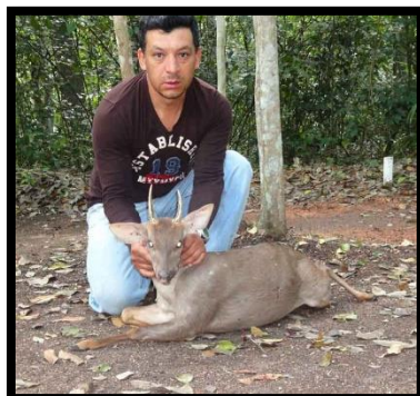
Brown Brocket Deer