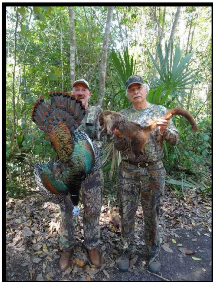
Ocellated Turkey & Coati