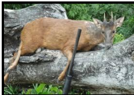
Red Brocket Deer