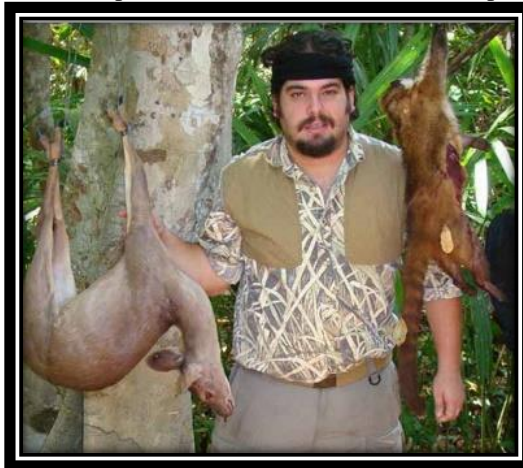
Brown Brocket Deer-Coati