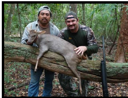
Brown Brocket Deer