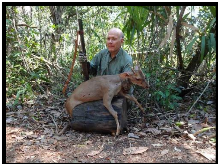
Brown Brocket Deer