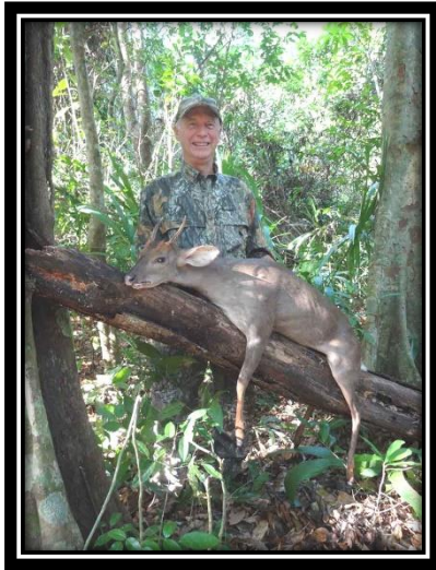
Gray Brocket Deer