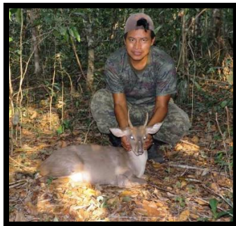
Brown Brocket Deer