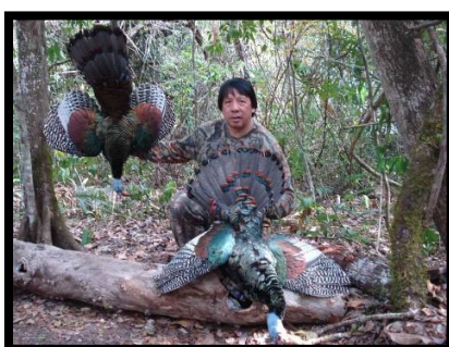
Female Curassow & Ocellated Turkey